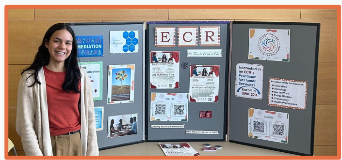
Marisabel in front of a display table in the Manchester University dining hall to celebrate Conflict Resolution Day and bring awareness to MU students of ECR's services